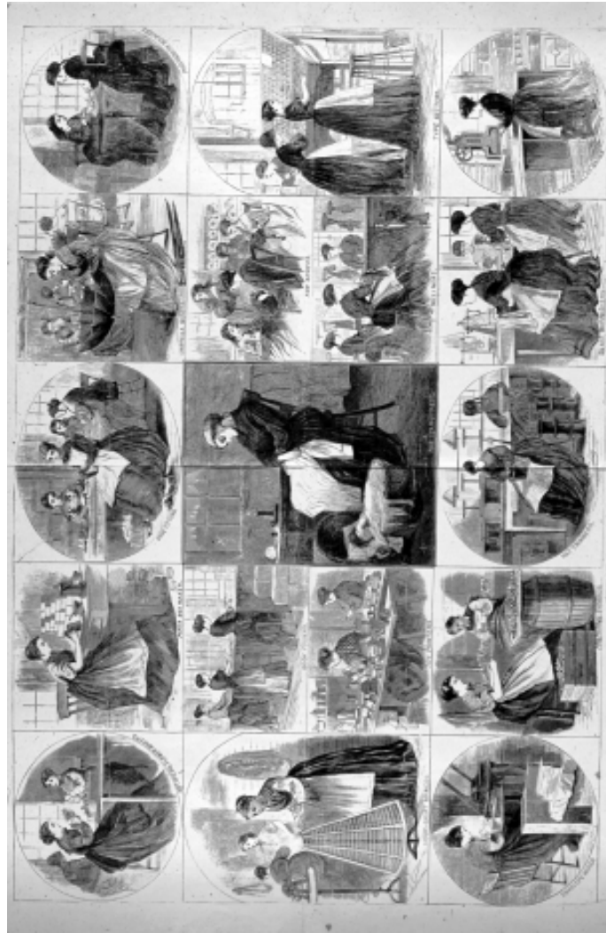
Figure 4.2 Stanley Fox, "Women and Their Work in the Metropolis," Harper's Bazar , July 28, 1869