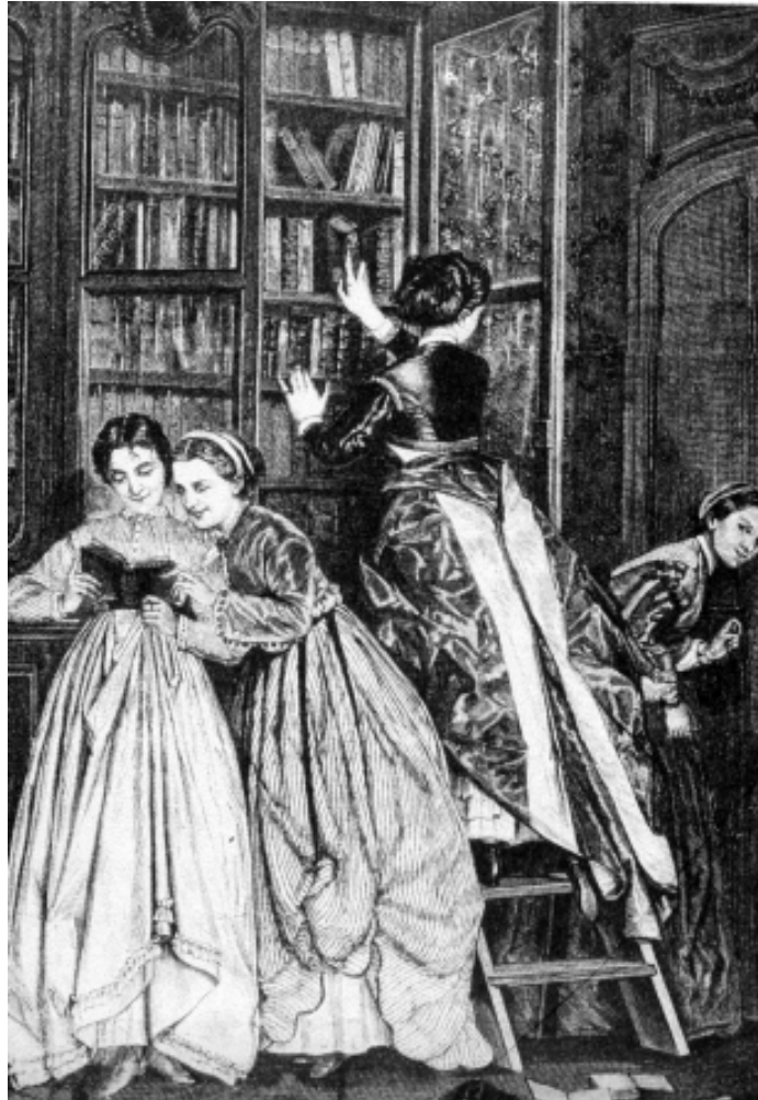
Figure 4.1 "Forbidden Fruit," 1865 engraving after a painting by August Toulmouche in Harper's Bazaar , June 19, 1869