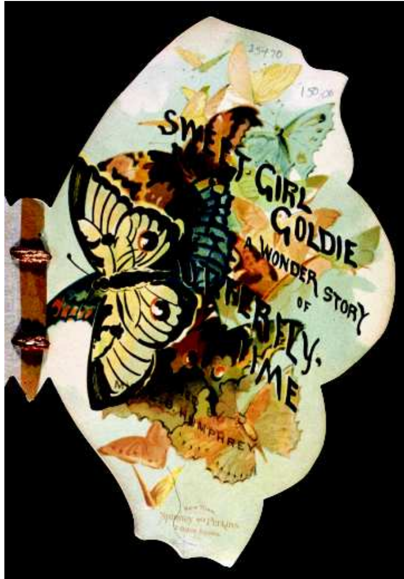
Figure 4.8 Lizbeth B. Humphrey, title page, Sweet Girl Goldie: A Wonder Story of Butterfly Time (New York: Spinney & Perkins, 1884)