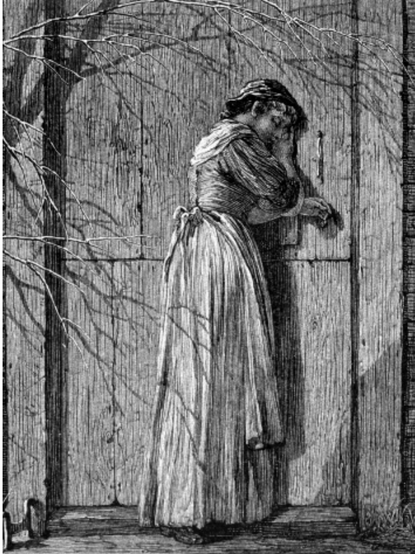
Figure 4.4 Mary A. Hallock, "She Leaned against the Door," in Mabel Martin: A Harvest Idyll , by John Greenleaf Whittier (Boston: James R. Osgood, 1876) p. 57