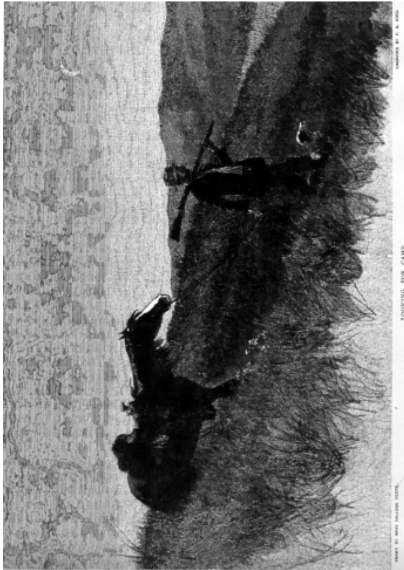
Figure 4.5 Mary Hallock Foote, "Looking for Camp," Century 37, 1 (December 1888): 108–9