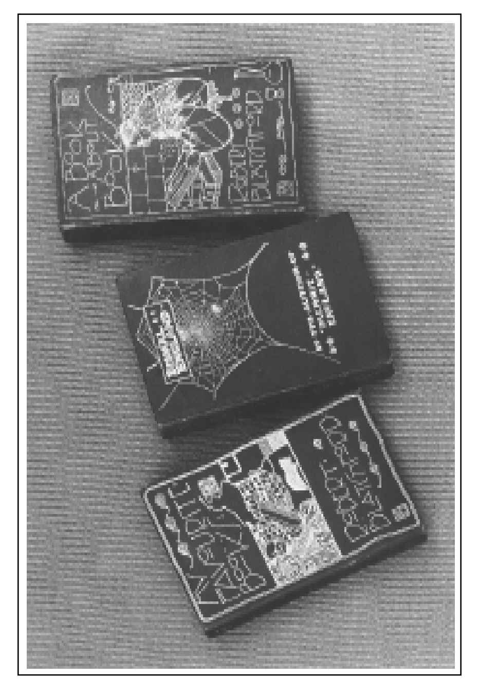
Figure 4.2 Exquisite bindings of three of Blatchford's books.