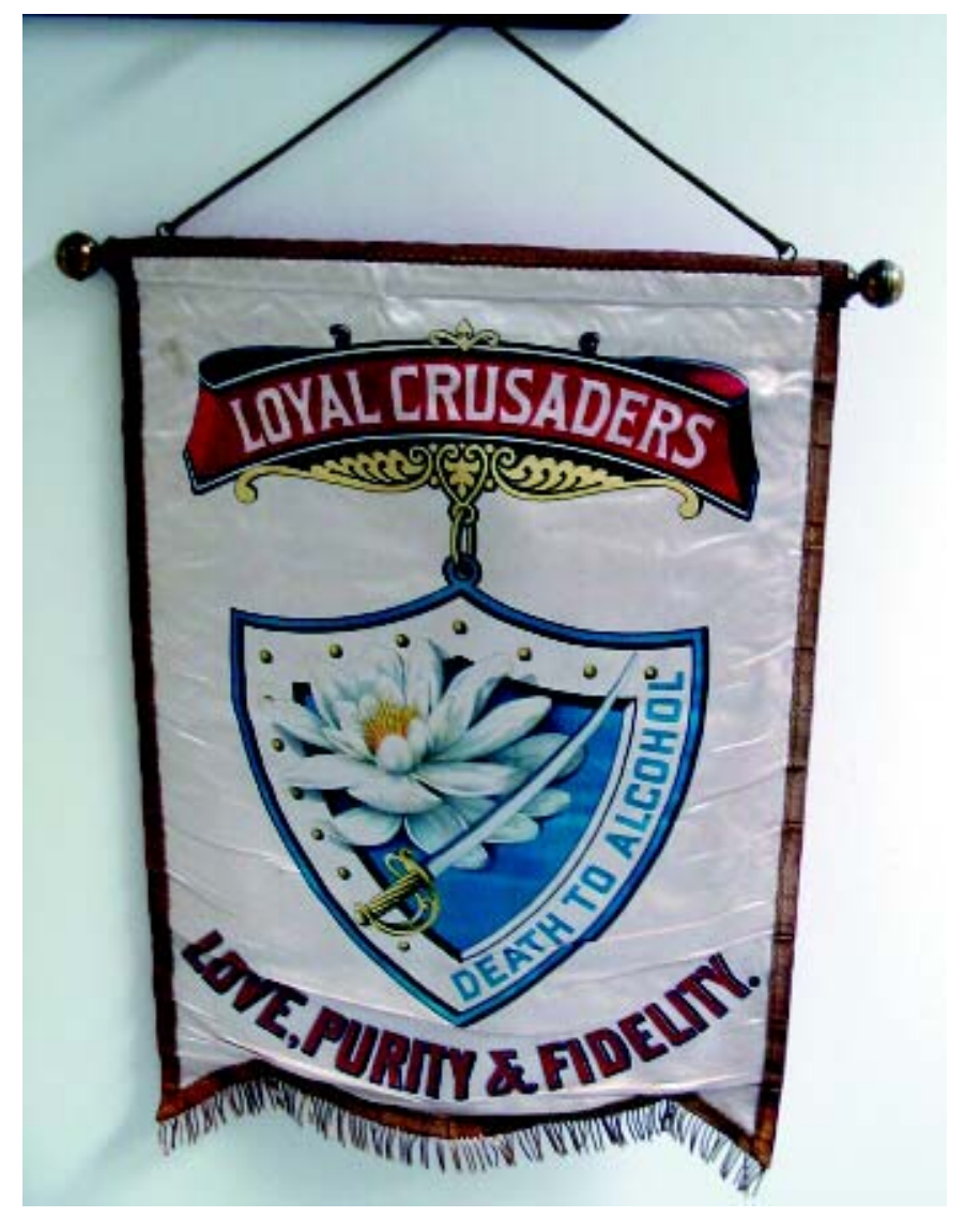
Figure 5.5 Banner from the Nova Scotia chapter of the Sons of Temperance