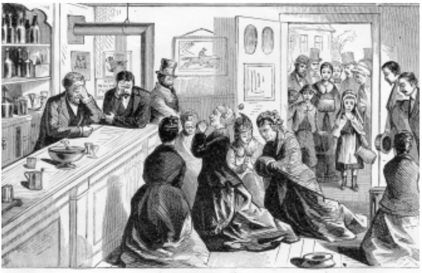
A CRUSADE SCENE.

workers. Through the 1970s, the primary focus of this field was on the identification and treatment of addiction as a disease. By the early 1980s, public interest had begun to shift toward the prevention of alcohol and drug problems, especially concerning youth. Once again, grassroots organizations, such as Mothers Against Drunk Driving (MADD), began to lobby the public and the government to legislate a policy that would reduce alcohol and drug use. This "neo-prohibitionist" approach has been particularly popular in antismoking campaigns. Judging from this return to temperance/prohibition rhetoric, one might say, "What goes around, comes around." Historians, sociologists, and others who are interested in social movements and in trends in social behavior and attitudes will find a wealth of material in this collection. In addition, researchers looking into the transition from temperance to research and the development of the modern addictions field will find valuable clues to the beliefs and actions of prominent figures. The Yale Center of Alcohol Studies (predecessor of the Rutgers Center) was at the forefront of this emerging field; thus, materials developed and collected by its leaders are especially important for documenting this evolution.