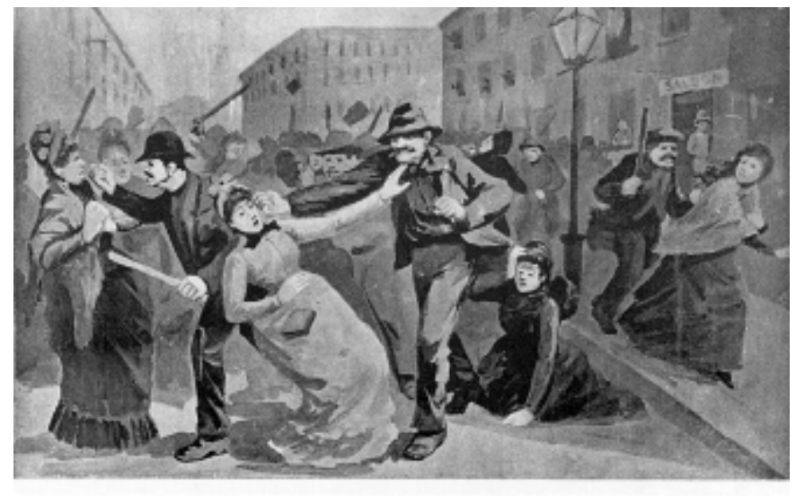
AN ATTACK BY THE MOB ON THE WOMAN CRUSADERS