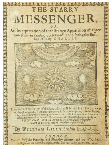
Title page of William Lilly, The starry messenger ... (1645)