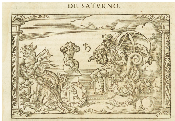
De Saturno (Saturn on a chariot eating children) from Arati Solensis Phoenomena et prognostica (1569, 1570)

Aratus was a Greek poet who lived from around 315/310–240 BCE. His work has been lost to us in Greek, but numerous Latin translations of his Phoenomena survived, such as the one contained