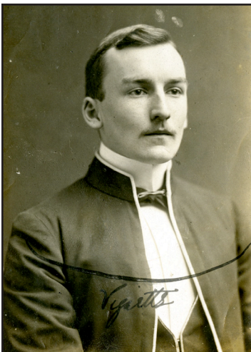
J.F.C. Fuller as a Sandhurst cadet ca. 1897, just prior to his official commission to the 1 st Battalion of the Oxfordshire Light Infantry in August 1898.

show as Fuller was a talented artist and draftsman as well as brilliant military theorist and historian. This accident of research also led to the colloquium at Rutgers University Libraries, "The Soldier and the Seer: J. F. C. Fuller, Aleister Crowley, and the British Occult Revival." co-sponsored by the Academia Ordo Templi Orientis. 23