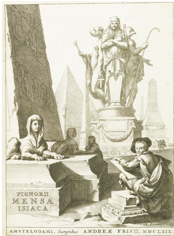
Frontispiece of Lorenzo Pignoria, Laurentij Pignorij Patavini Mensa Isiaca... (1670)

replicate the various parts of the Table, and were included,