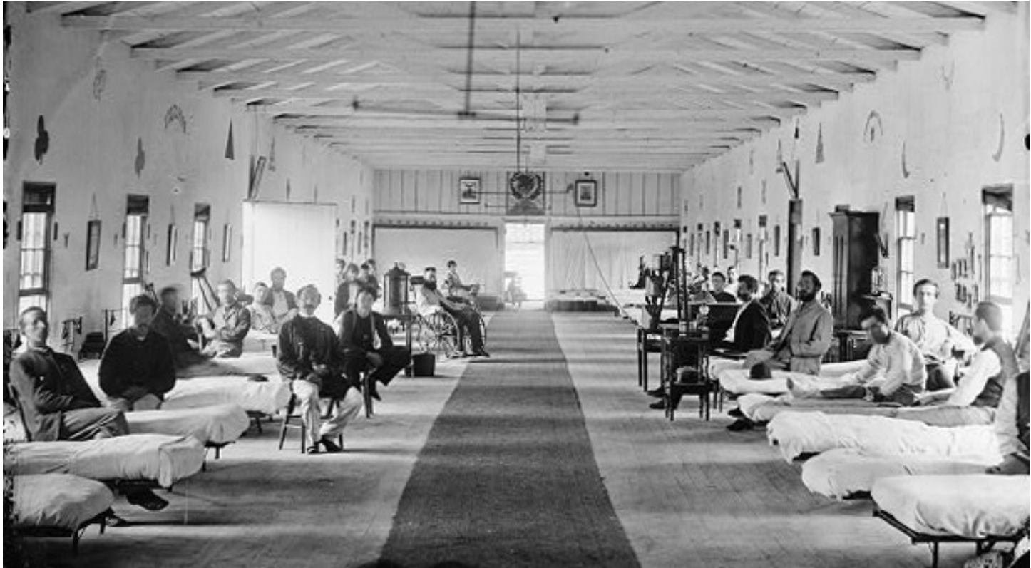
Patients in Ward K of Armory Square Hospital, Washington D.C. , August 1865.