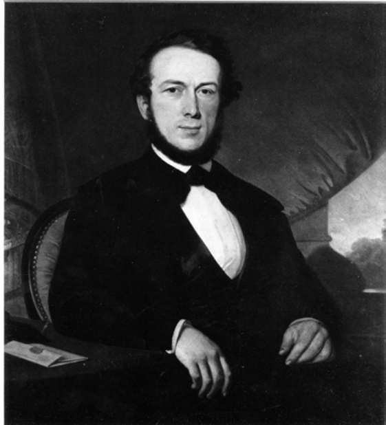
Portrait of Marcus Ward, undated.

Founded in 1866 by Marcus L. Ward, the New Jersey Home for Disabled Soldiers focused on the concern for and care of New Jersey veterans. In reading through a series of registrar books dating from July 1866 to March 1874, I found that a number of veterans were admitted under the diagnosis of "mental derangement." As one physician wrote after examining a 20 year-old veteran from Newark in 1866, "This may certify that I examined [name omitted] of Company C2 Volunteers and find him to be suffering from mental derangement—the result of [war] service, which, in my opinion, incapacitates him from earning his own living." 15