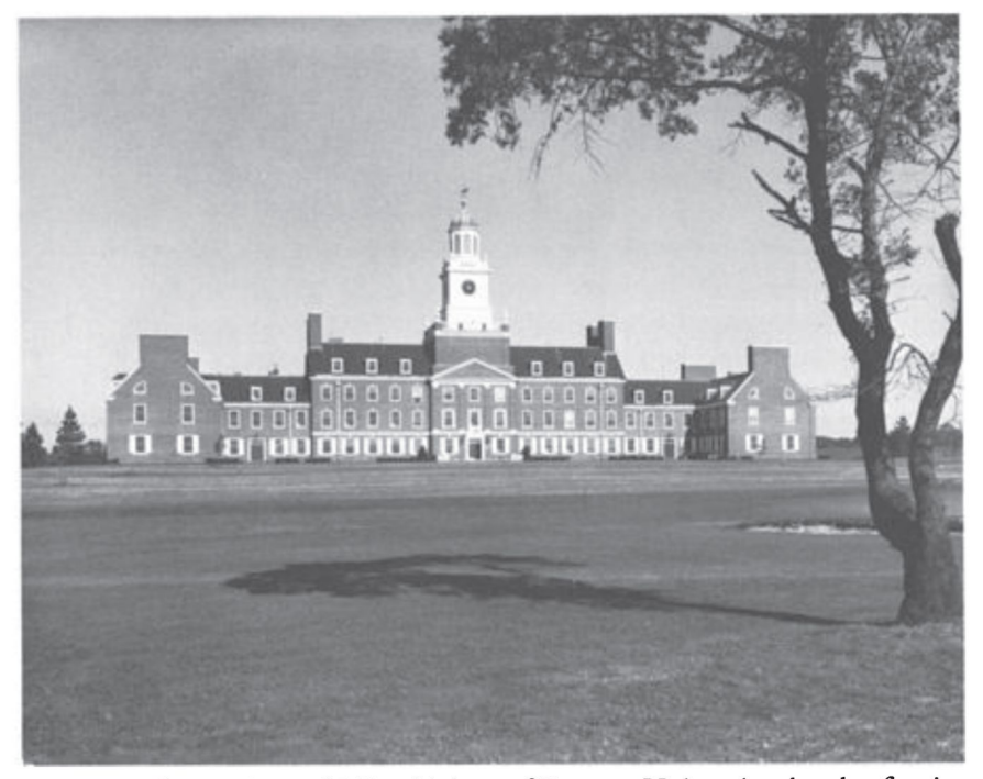
Figure 1. The Institute of Microbiology of Rutgers University shortly after its opening.

Except as otherwise indicated, this account of the history of the Waksman Institute is based on the author's personal recollections refreshed by perusing the reports of the Institute published by Rutgers, The State University of New Jersey, between 1955 and 1985. The first three reports were biennial, the others were published annually. In these reports, those interested will find complete lists of the personnel of the Institute and of the publications of the scientists associated with the Institute.