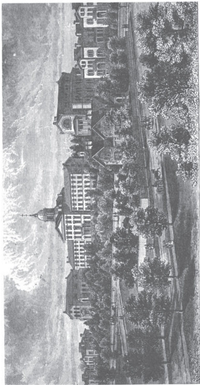
SAGE LIBRARY HALL.