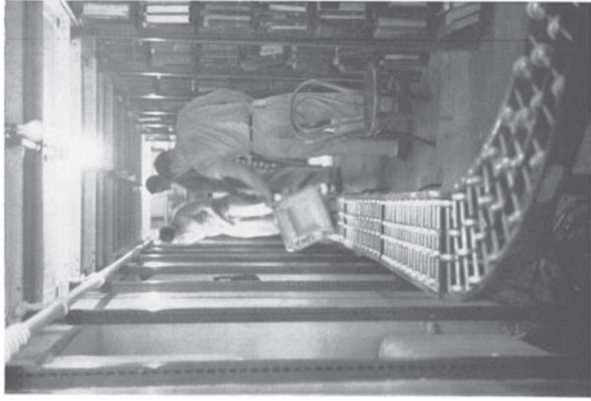
Moving books from the lower stack