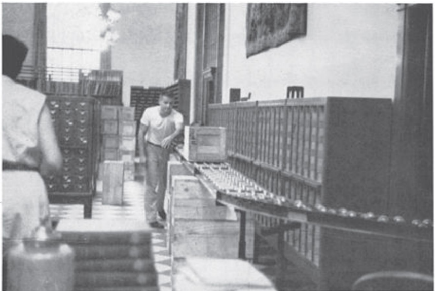
Moving a thousand trays from the card catalog