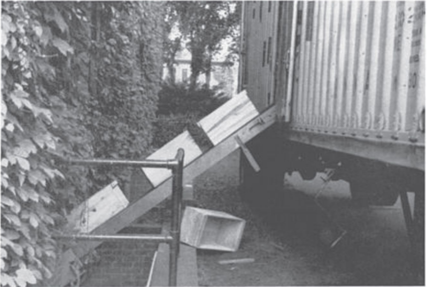
Mechanical conveyer emptying the lower stack