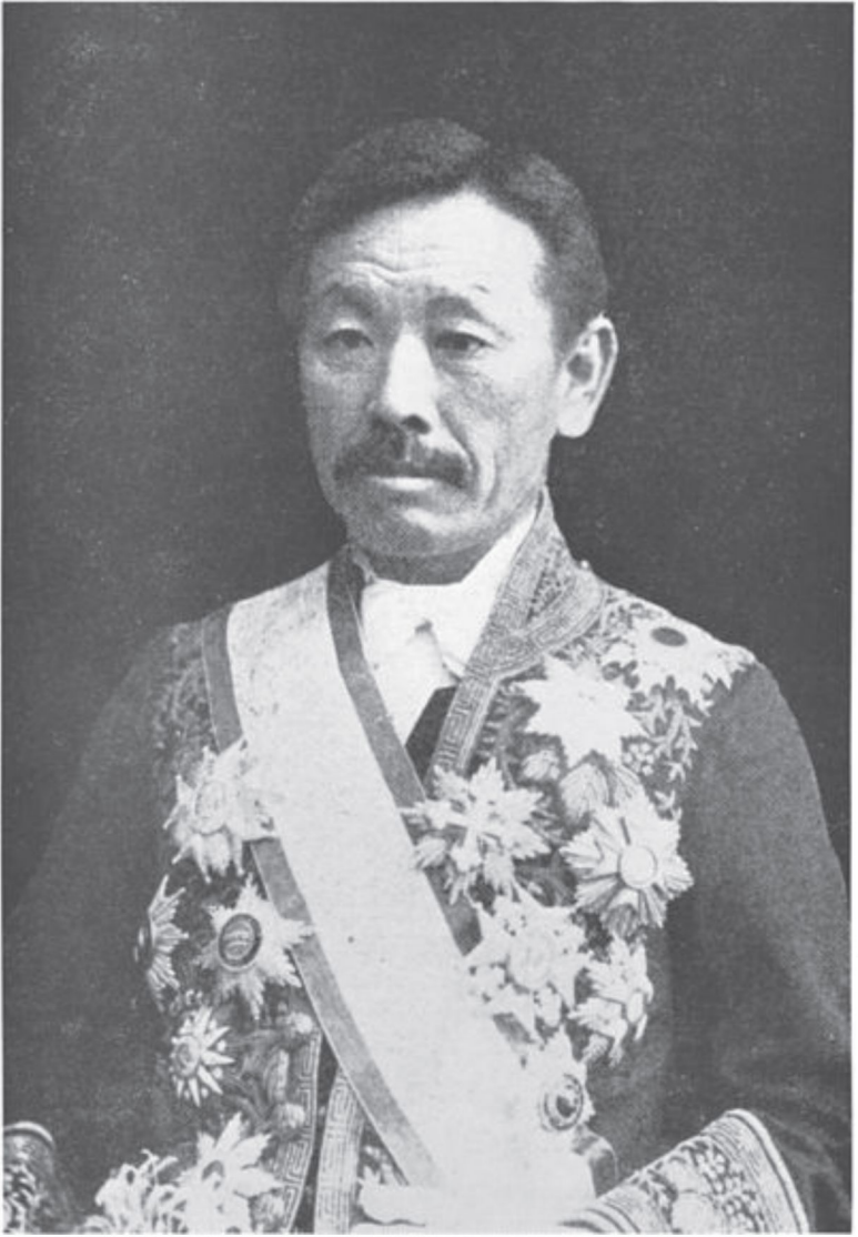
COUNT INOUE KAORU