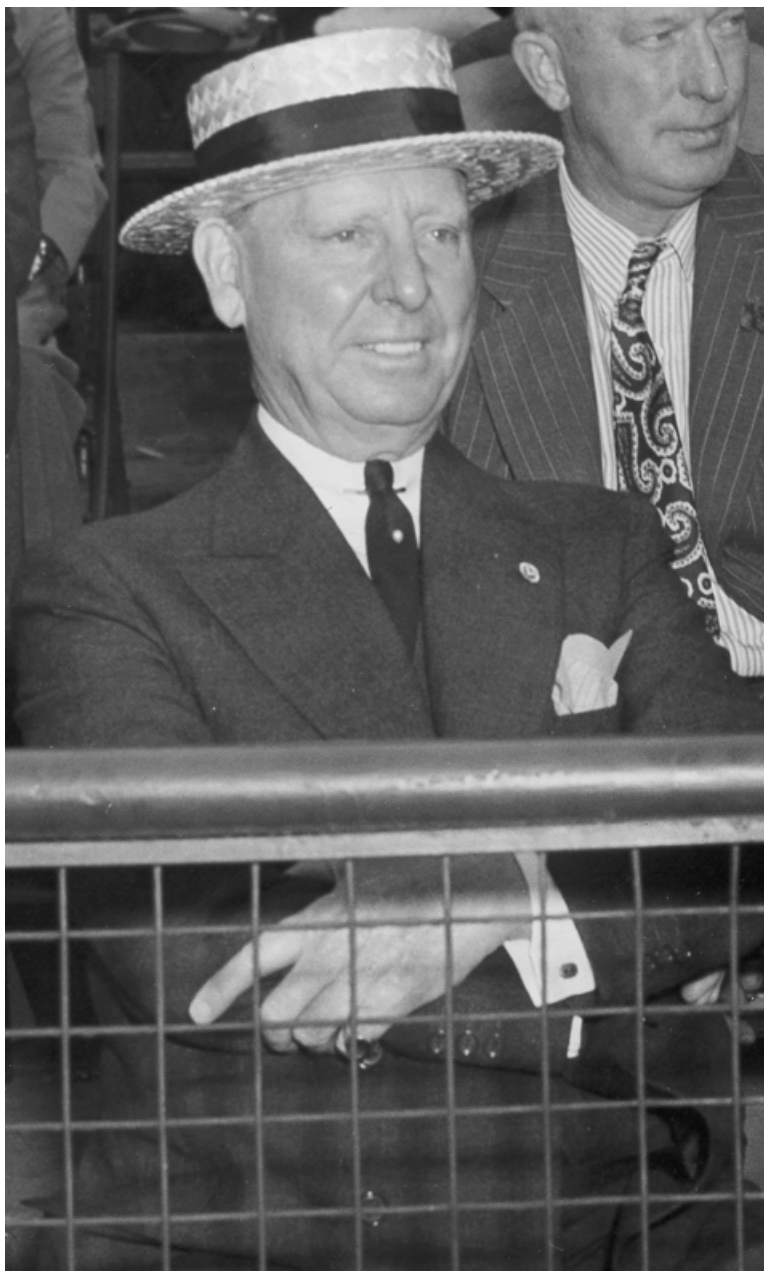
Fig. 3.2 Photo of Frank Hague at Roosevelt Stadium in early 1940s.